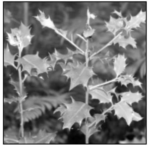
A Holly is becoming widespread throughout forest understories in the Puget Trough, crowding out native, less aggressive species.

Yes, it lights the freeway, but it also blights the forest. Introduced as an ornamental